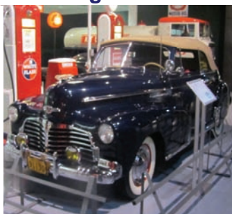
On Display at the AACA Museum, Hershey, PA